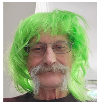
Wait? I didn't see him at the picnic!