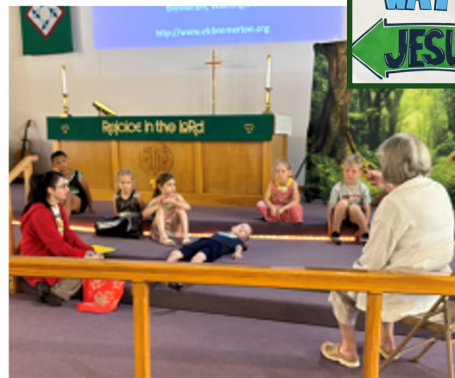
The Bible Story.....