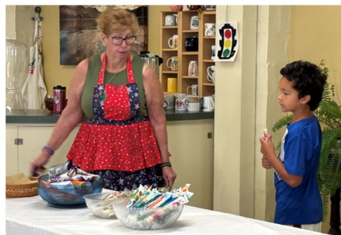
Snack Time .....