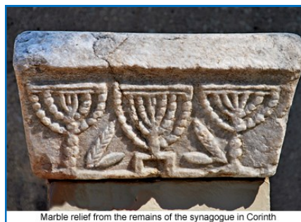
Marble relief from the remains of the synagogue in Corinth

that you were baptized in my name. Paul made it clear that he wanted