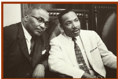
Marin Luther King Sr & Martin Luther King Jr

Did you know... that in 1934 a black pastor from Georgia who was so impressed with what he learned about Martin Luther that he legally changed his name from Michael King to Martin Luther King? And, he also changed the name of his young son, to Martin Luther King Jr.