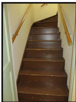
Stairs to the choir loft.

This is a view of the sanctuary that many remembered. Either people sang in the choir or sat with parents that were in the choir.