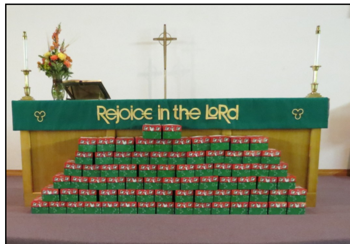
78 boxes changing 78 children's lives