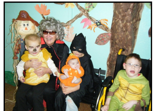
How Much Fun is THIS ?