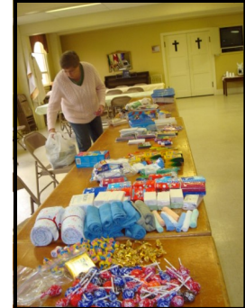
A fun Work Party for Operation Christmas Child

It is never too early to keep an eye out for small items that can fit into the shoeboxes next year.