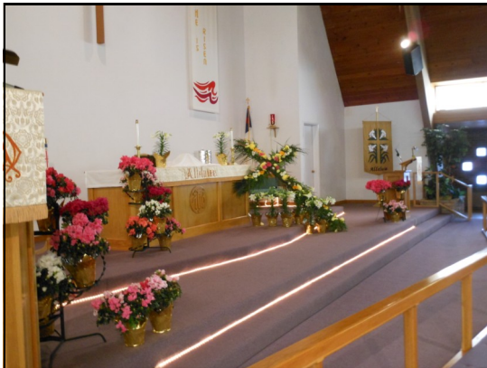
Easter At Emmanuel