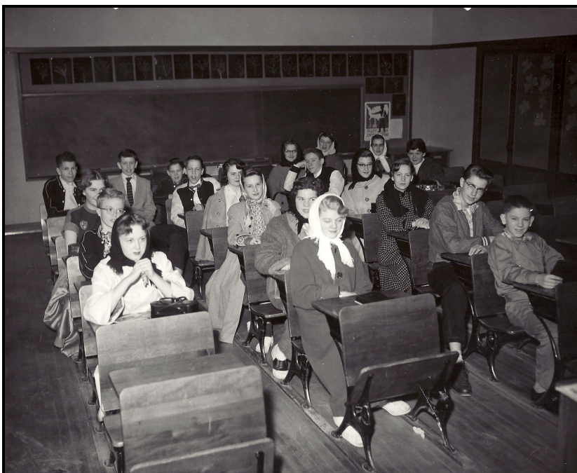
Sunday School Class in 1952