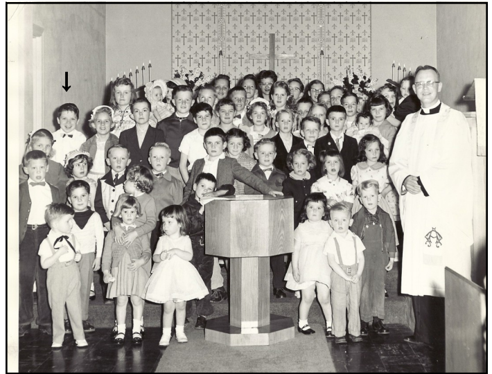
84 Baptisms in Two Months ????

Sunday, May 5, 1954, was Emmanuel’s (at that time Manette) fourth birthday as a congregation. A newspaper article read; “four years ago this location on the corner of Perry and Magnuson was just a plot of ground overgrown with weeds. Our church, it’s buildings and it’s congregation with all it means to it’s Christian members, was at that time only the Faith that God could do great things for His people. It’s a mistake for anyone to underestimate the power of God to make good on our Faith in Him. “