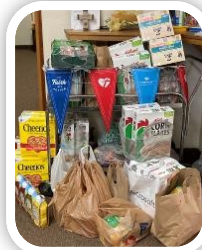
The little church that gives big!!!

Our Food Bank Mission is not only important, it's vital! There are so many people whose lives are impacted by the lack of food. As evidenced by the little girl who admitted in her virtual classroom that she was starving. Her mother had lost her job due to Covid. Another young man, age 14, said "It wasn't his day to eat, it was his brother's turn." A family of six moved into their car after losing their home, a teenager said his family stocked up on rice so they would have something to eat. Covid has "killed" so many jobs, especially for low wage workers, women and minorities. Many of those jobs will never make a full recovery. Nine million plus jobs have been lost due to Covid, Four and a half million people who have lost their jobs do not have enough to eat. Of those low wage jobs that will recover, the recovery will be a long-time coming. Meanwhile, those workers without hope and without resources will have to depend on the human kindness of others the kind of kindness we witness each and every first fruits Sunday at Emmanuel.