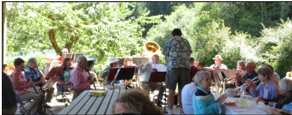
Entertained by "The Home Town Band" , an annual tradition.