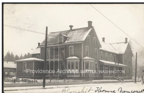
Original St. Joseph's Hospital- Vancouver