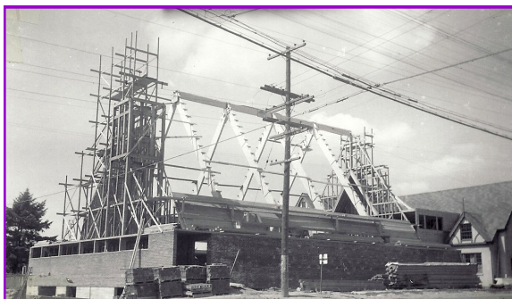
The walls began in 1956

receive in the mail. For there are people in other cities, other states, and yes, even in Africa who monthly get the word that whoever they are they are always welcome to join us and share the secret of what takes place, behind these walls.