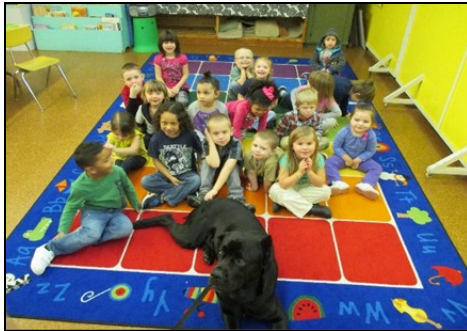
The preschoolers enjoy a visit with Leo, the service dog.

Devotions this month will include Zacchaeus, Abraham and Sarah, Widow's Mite, Peter. Mardi Gras and Ash Wednesday. On Friday, February 13th the preschoolers had a Valentine Party. Both the preschoolers and the school-aged children had a special snack that day. The children brought in valentines for the rest of the children.