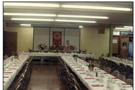
The Fellowship Hall was downstairs in 1986.

Our Daycare Center uses this area today.