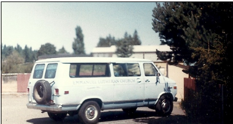
Wow! Emmanuel Lutheran Church owned a van !