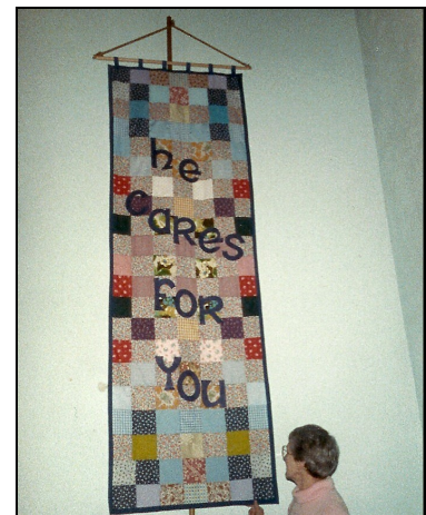
This is a beautiful banner from 1986.