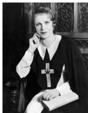
Aimee Semple McPherson