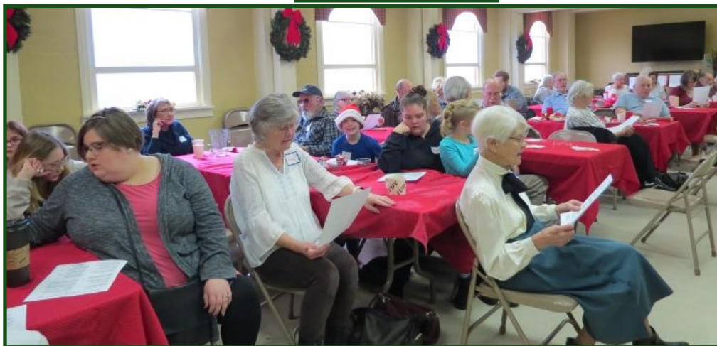
We always celebrate by singing some of the traditional carols.