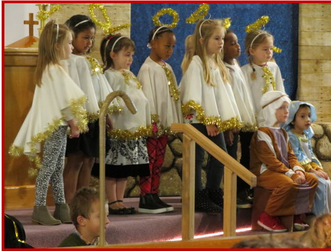
The Annual Christmas Pageant

The miracle of Jesus birth told through the children's voices.