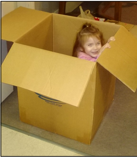
Our own little "Tiff in the Box"