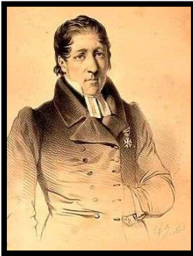
Lars Levi Laestadian 1800–1861