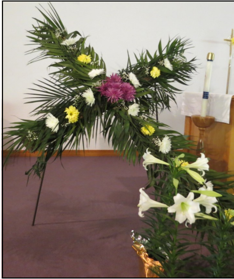
Special Thanks to Miki for the wonderful job of decorating our beautiful cross.