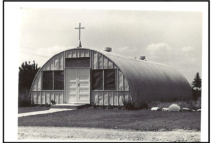
Our first chapel purchased in May 1946 from War Surplus. It cost the members $450.

After the Quonset Hut was purchased the men and boys worked very hard to prepare the grounds for the church.