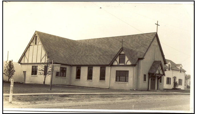
The first church building and parsonage are completed. Does it look familiar? Yes, it is the same two structures.

Evelyn Souffer remembers there being 300 students at one time in Sunday School.