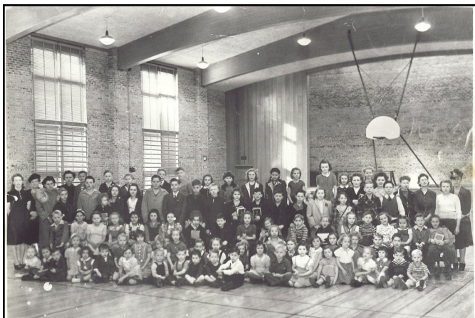
Sunday School Attendance was so high the church had to rent space from a local school.

“Our second anniversary found us with a membership that had grown to 150 and a Sunday School enrollment of 140.”